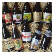
LOCALLY SOURCED LUXURY BEER HAMPER