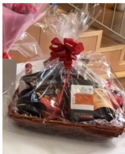
LOCALLY SOURCED LUXURY WINE HAMPER